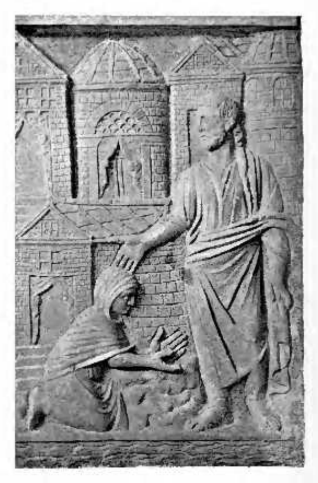
FROM A SARCOPHAGUS, PERHAPS REPRESENTING THE STATUE OF OUR LORD AT BANEAS