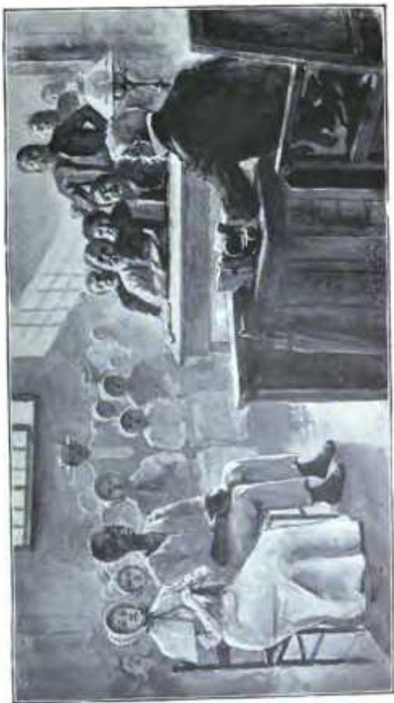
"Lucretia Mott quickly took her place beside the colored man."—Page 142.