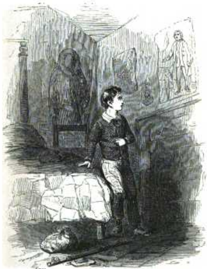
“The fading light only served to show the outlines of General Washington, whose figure was known to me” p 38.