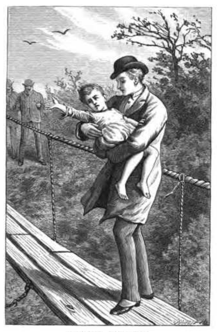
A RASH VENTURE