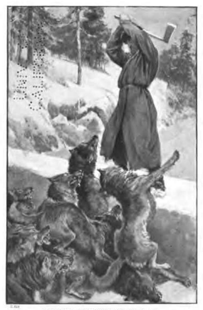
PETRUSHKA HOLDS THE WOLVES AT BAY