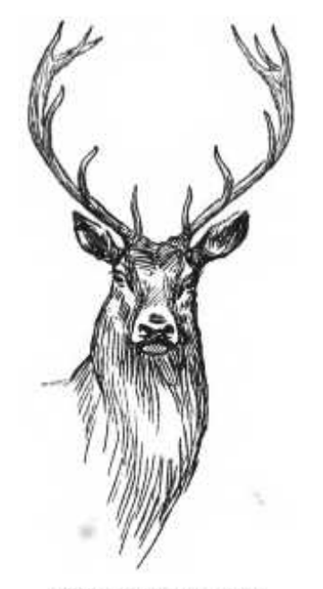
THE OLD BLACK STAG