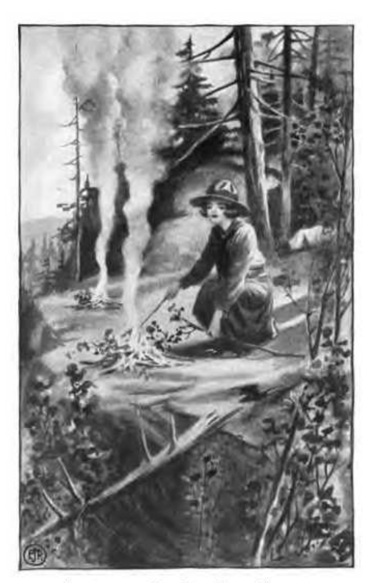
SHE ARRANGED TWO SUCH SMOKE COLUMNS