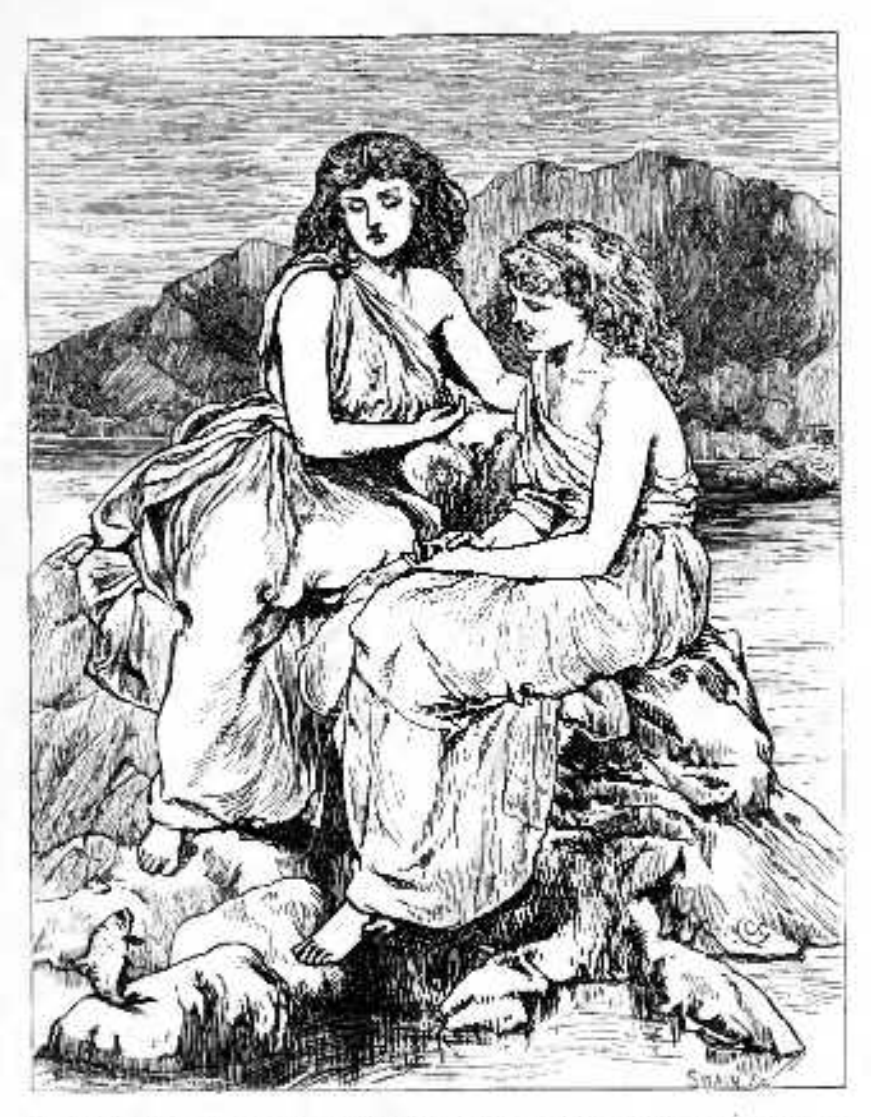
"Too meather iteratives seated themselves uson the book, and thinkin was northered to find that he was competed to admire at a destance." Frage 58. Frontighter.