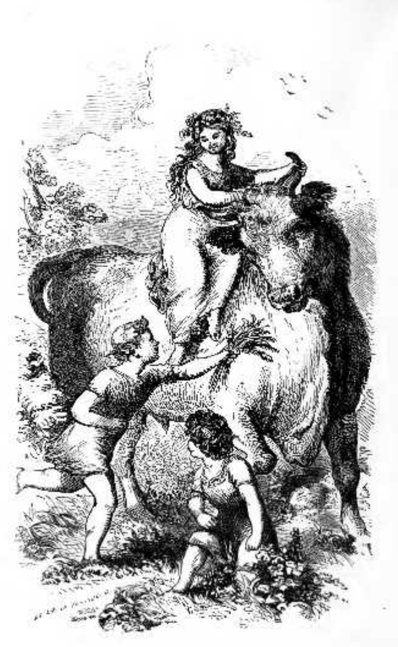
RUROPA AND THE BULL.