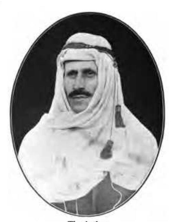
The Author With knglych as worn on the tour described in this book.