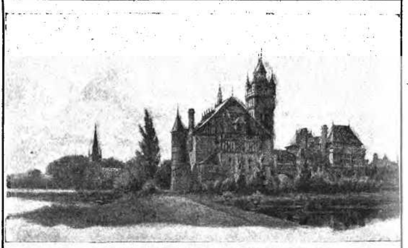
SHAKESPEARE MEMORIAL, STRATFORD-UPON-AVON.